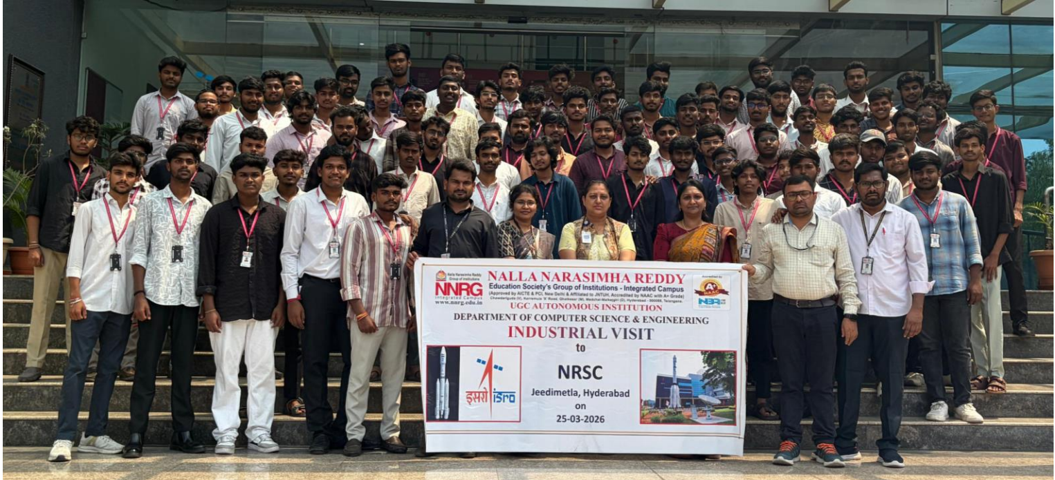
Group photo of students and faculty members with NRSC Team